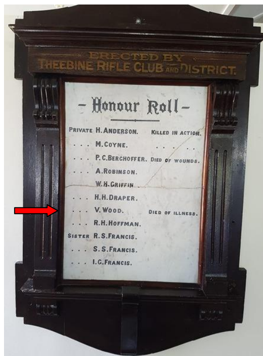
Theebine Honour Roll

Private V. Wood is remembered on the Theebine Honour Roll, erected by Theebine Rifle Club and District & located in the Theebine Memorial Hall, 6 Old Cleveland Road, Theebine, Queensland.