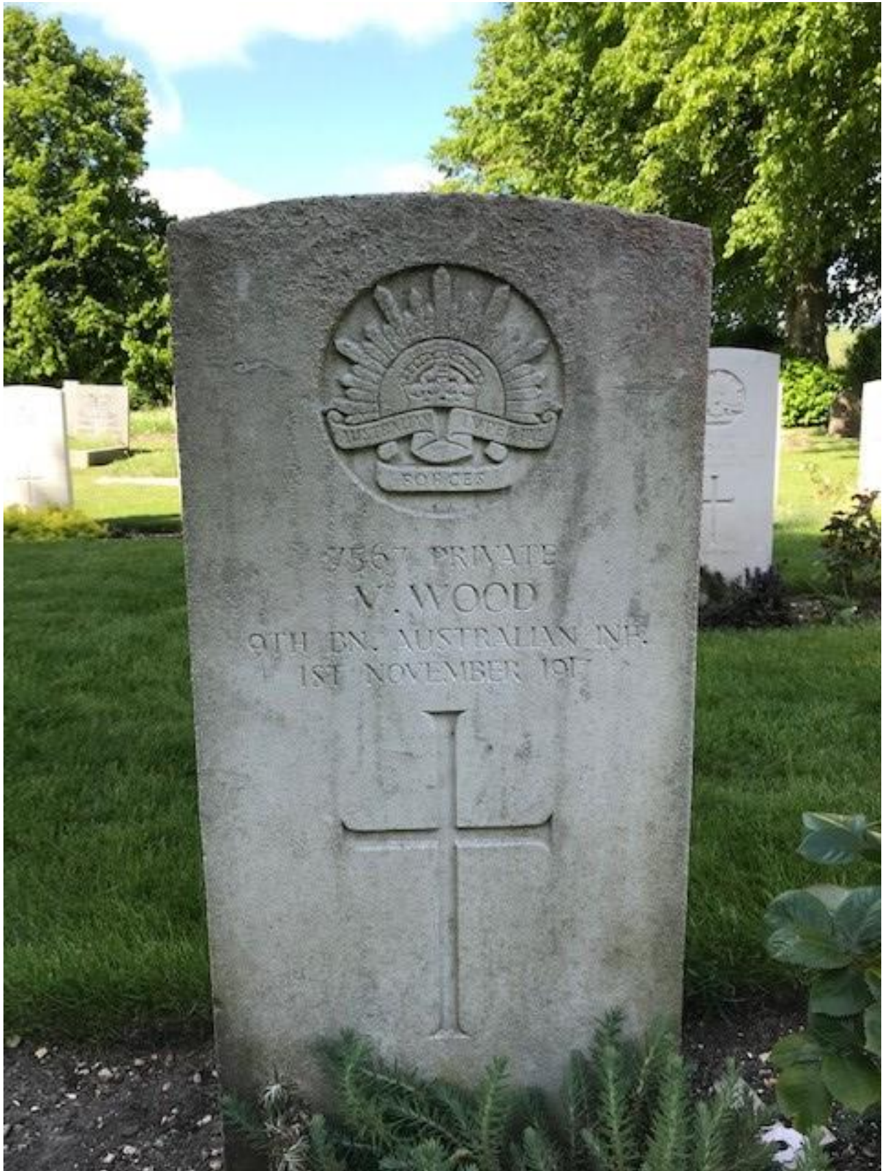
Photo of Private V. Wood's Commonwealth War Graves Commission Headstone in St Lawrence's Churchyard, Stratford-sub-Castle, Wiltshire, England.